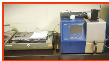
Fig. 1 : INFRATEC™ 1241 Grain Analyzer.