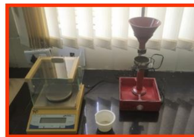
Fig. 2 : Hectoliter Weight kit.